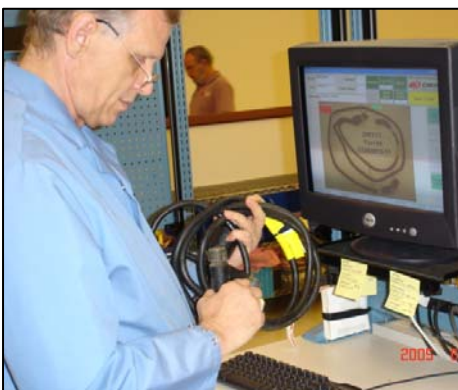
Repairs being made to a cable set.

Repair. Totes of inspected cables are routed to the desired station. Each cable is pulled from its tote and scanned to display the visual record. The team member makes the needed repair and notes the completion of the repair. Each green flag indicates a completed repair at that location. (See Figure 3.)