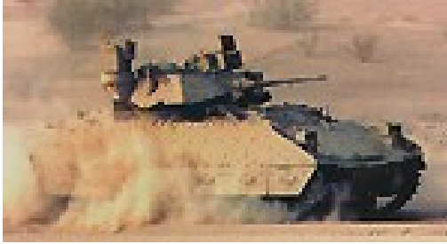
The Bradley M2/M3 A3 Fighting Vehicle

Refurbishing any modern vehicle can be a daunting task. It becomes all the more so when the vehicle is a Bradley Fighting Vehicle, designed to take America's finest into harm's way. Yet this is the very challenge facing United States Department of Defense (DOD) manufacturer DRS Laurel Technologies in Johnstown, Pennsylvania, a division of DRS Technologies.