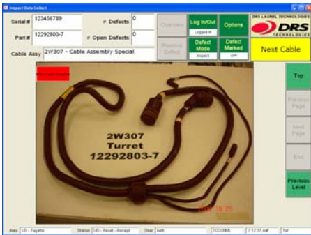
Figure 1. Visual record is created