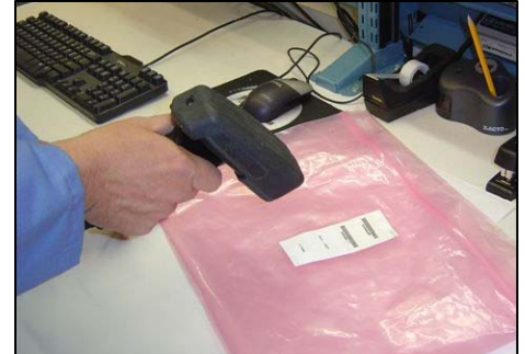
Cable data is scanned to update information prior to shipping

"DRS Laurel Technologies put together an entire quality document for this program with work instructions on how we will make repairs, taking into account that different areas require special considerations. With Inspect special work instructions are embedded right on the screen. Instead of having people search out and read a document, the things that are critical to a cable are right there on the screen. It's very visual and it's very simple. It tells you exactly what to do!"